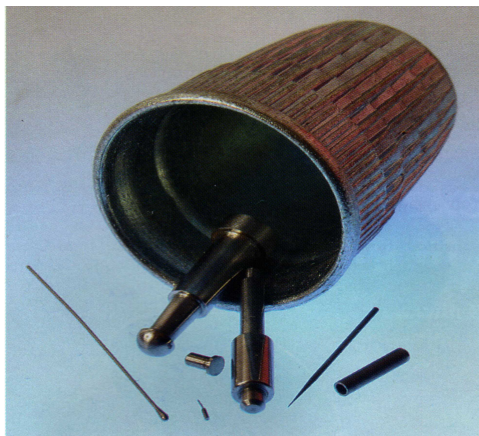
A small sewing thimble looms larger over a selection of precision parts ground at M&S.

Taking a pad and pen onto the shop floor, he writes down every variable in the process, changes only one variable