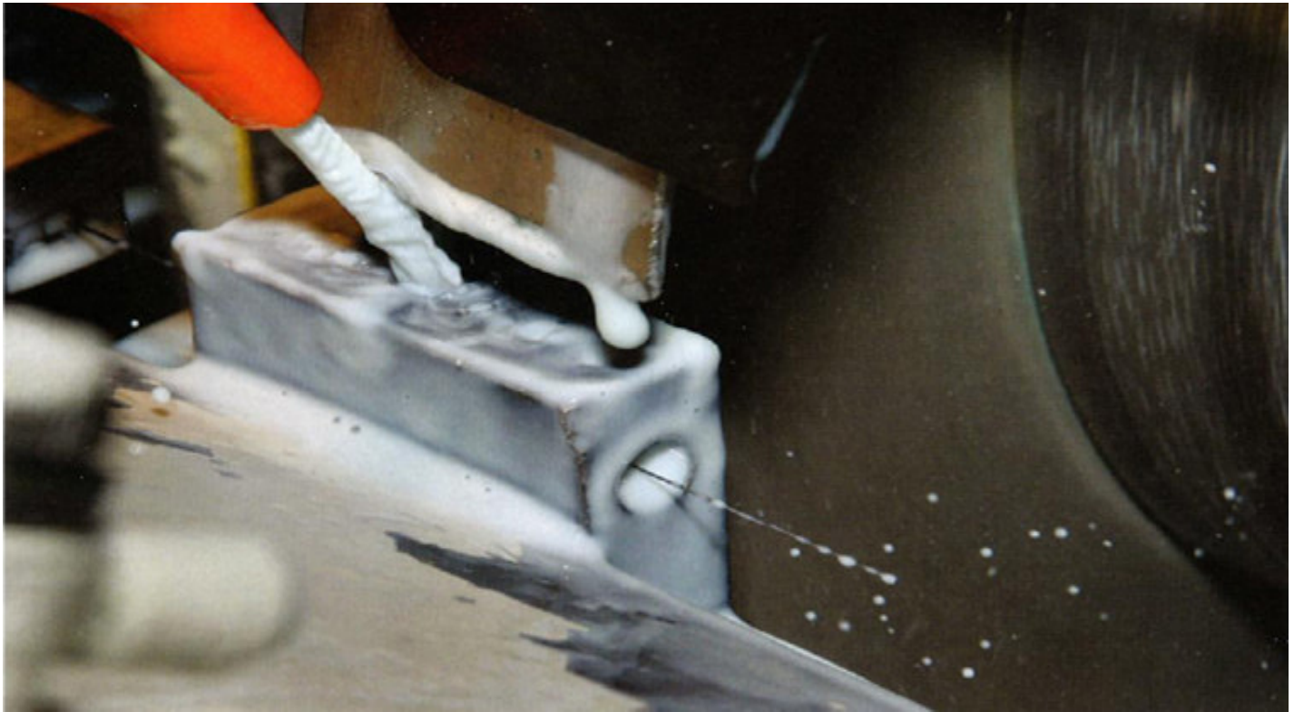
M&S hold tolerances down to 0.00002" on ground parts. Shown is a secondary diameter of 0.010" being ground on a cardiac guide wire.